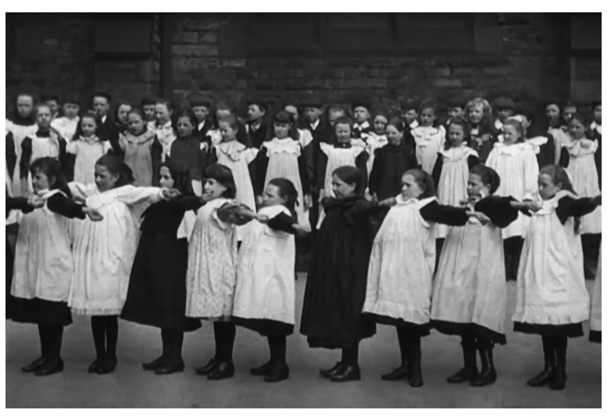
Audley Range School, Blackburn, 1904.